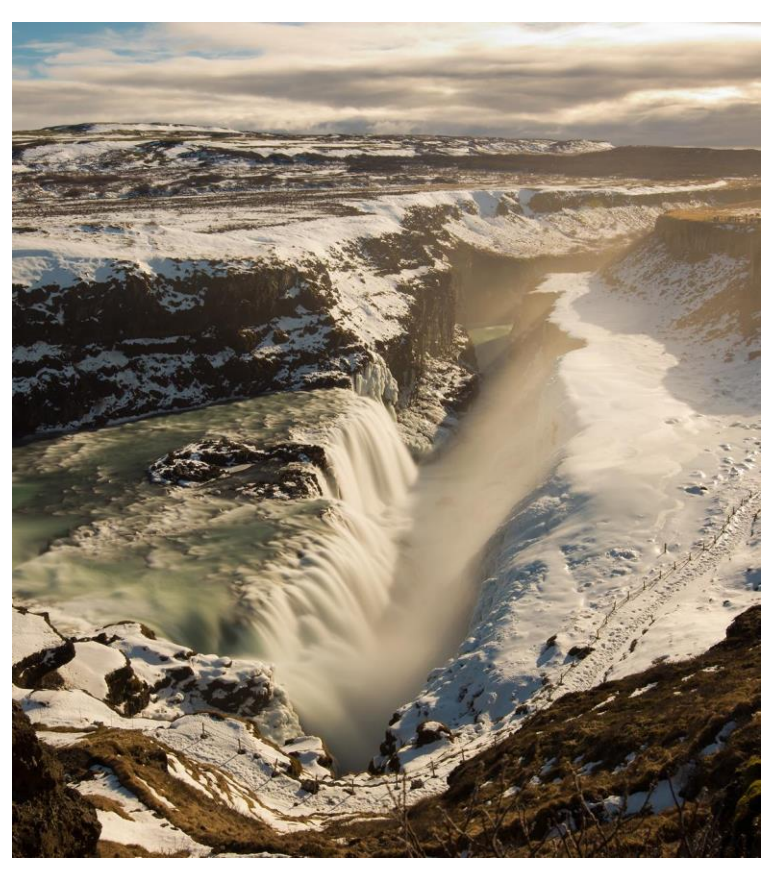
7 Days • 11 Meals: 6 Breakfasts, 5 Dinners

HIGHLIGHTS... Reykjavík, Northern Lights Cruise, Search for the Northern Lights, Golden Circle, Thingvellir National Park, Gullfoss, Lava Exhibition Center, Vik, Seljalandsfoss, Skógar Museum, Skógafoss, Jökulsárlón Glacial Lagoon, Skaftafell National Park & Vatnajökull Glacier, Blue Lagoon