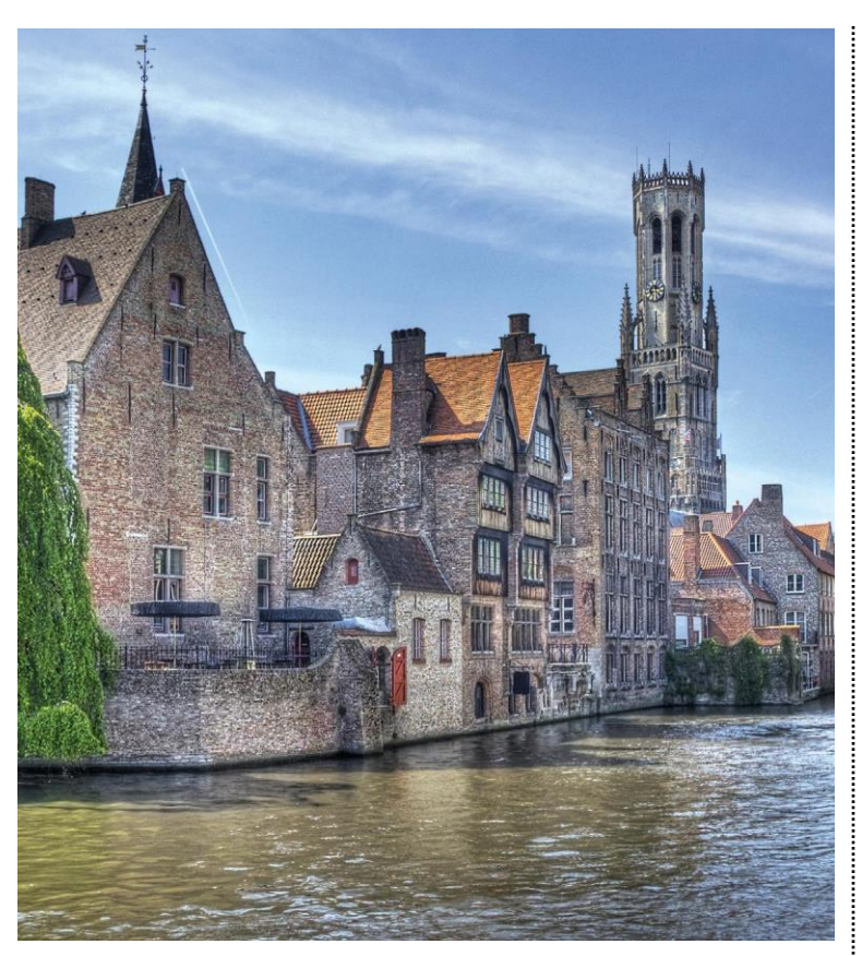
9 Days • 20 Meals: 7 Breakfasts, 6 Lunches, 7 Dinners

HIGHLIGHTS... Amsterdam, 7-Night River Cruise, Arnhem, Middelburg, Bruges, Antwerp, Kinderdijk Windmills, Keukenhof Gardens